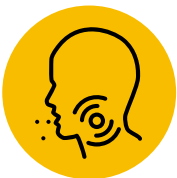
Cough / sore throat